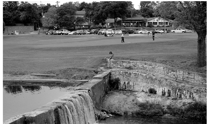
Non-potable irrigation water is used on golf courses in Georgetown, including the Georgetown County Club course, which reduces the demand on City water treatment plants.

8 a.m. - 2 p.m., Community Center, San Gabriel Park All proceeds benefit the Georgetown Animal Shelter.